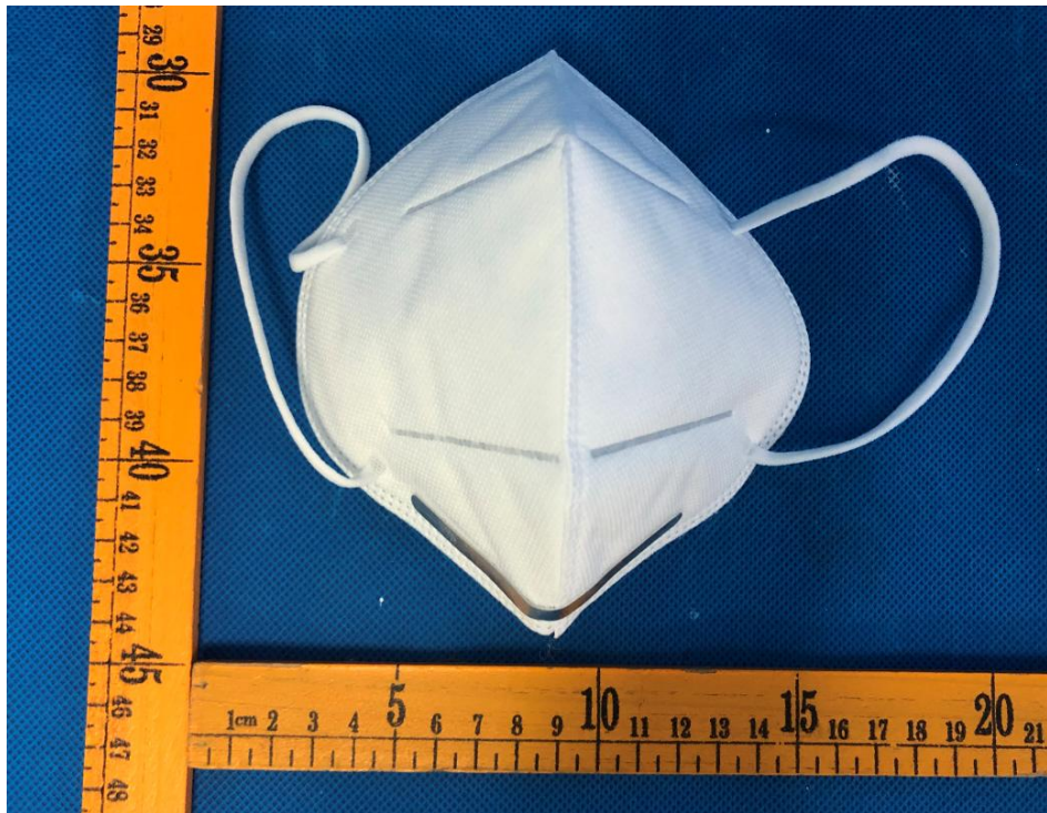
General view for BF-AM