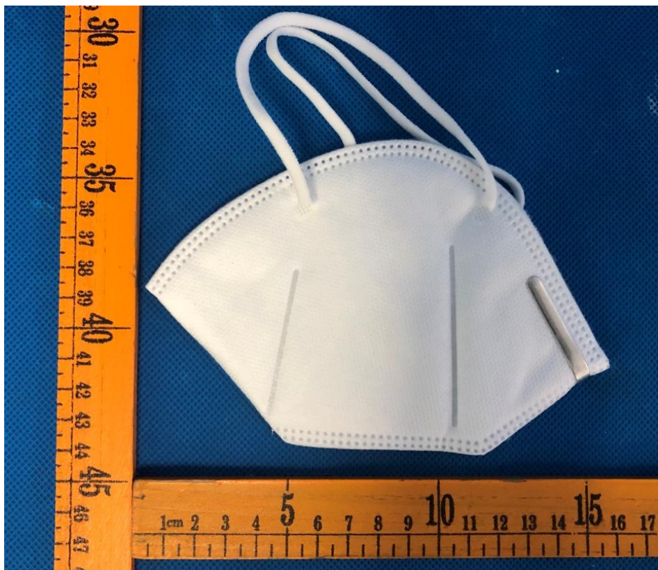
General view for BF-AM