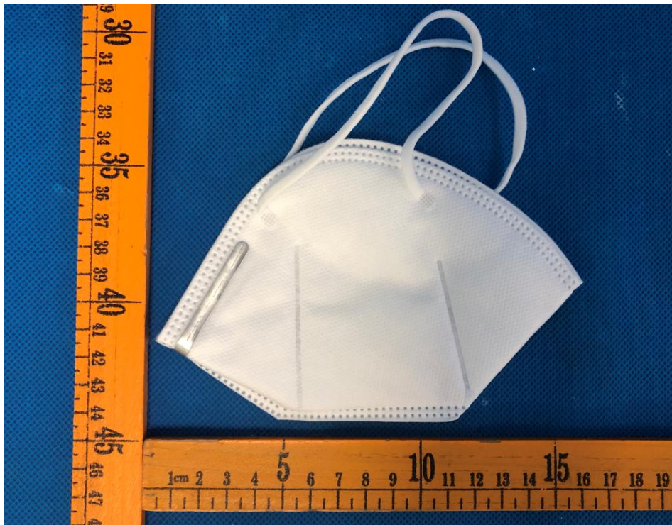
General view for BF-AM