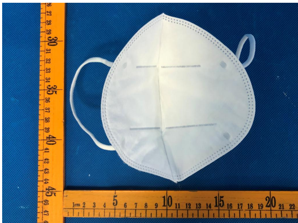
General view for BF-AM